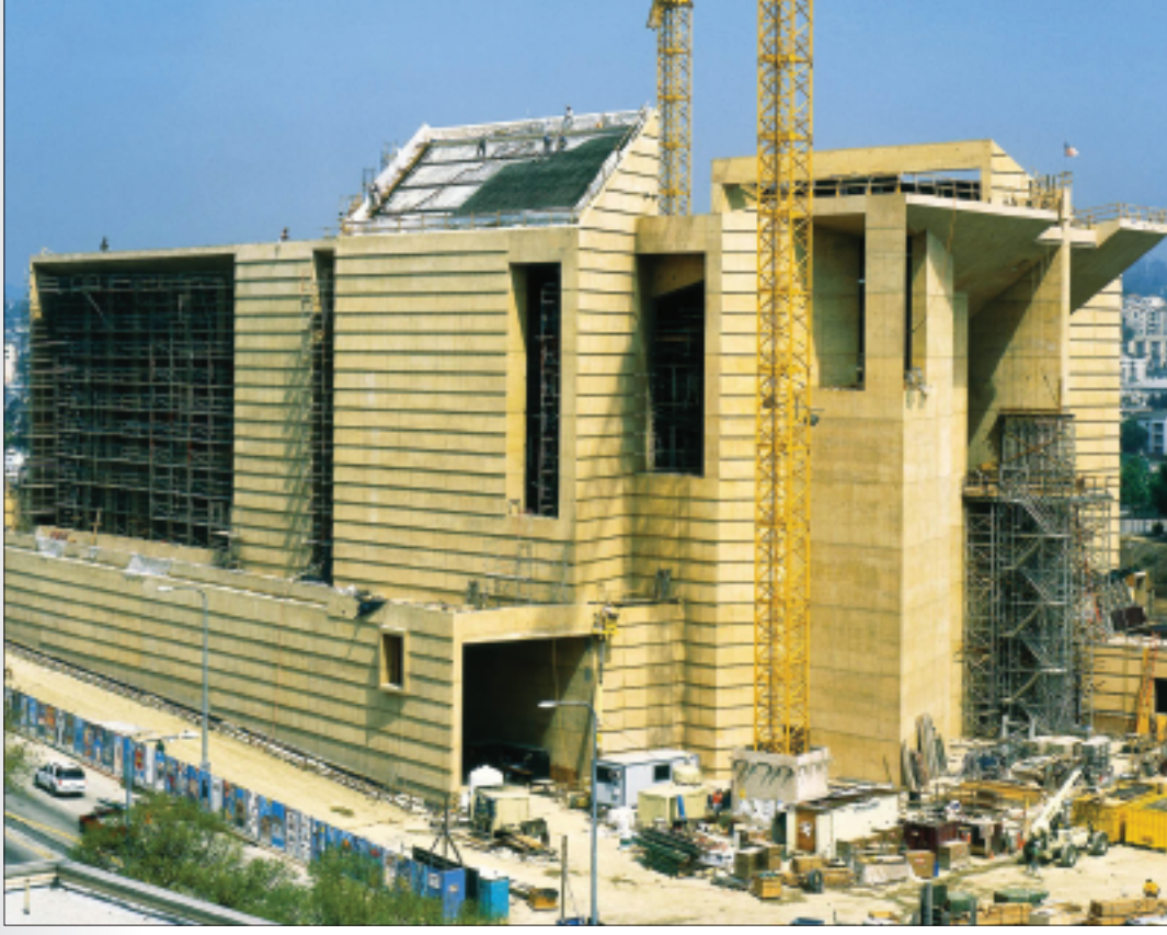
Cathedral of Our Lady of the Angels, Los Angeles, CA